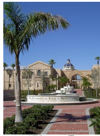
UT Brownsville Brownsville, TX ~ Est. 1926 Motto: "Imagining More" Mascot: Ocelot