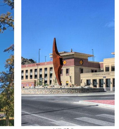
UT El Paso El Paso, TX ~ Est. 1914 Motto: "Access and Excellence" Mascot: Miners