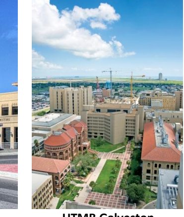
UTMB Galveston Galveston, TX ~ Est. 1891 Motto: "Working Together to Work Wonders"