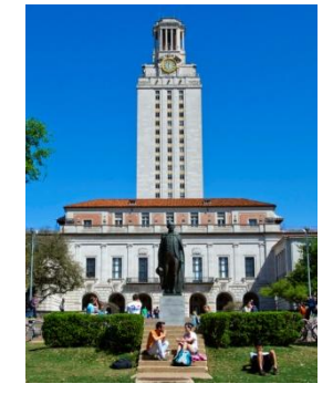
UT Austin Austin, TX ~ Est. 1883 Motto: "What Starts Here Changes the World" Mascot: Longhorns