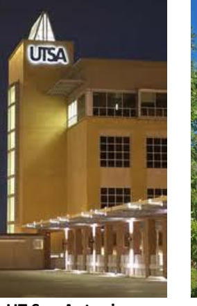
UT San Antonio San Antonio, TX ~ Est. 1969 Mascot: Roadrunners Motto: "Creating Solutions"